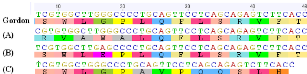
Figure 2. Amino acid sequence compared to Gordon et al. (1983). A) Sequence with deletion at positions 1740, 1743 and 1754. B) Sequence with deletion at positions 1745, 1749 and 754. C) Sequence with deletion at positions 1749 and 1754.