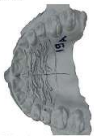
Figure 1 : Delineation of palatal rugae pattern on dental casts

door to door system in each subdistrict. Prints of jaws of the respondents were obtained after the research was explained to them and informed consent was provided. The Committee of the Research Ethics of the Faculty of Medicine, Andalas University, with regard to the protection of human rights and welfare in medical health research has carefully reviewed the research protocol with Ethical Clearance number 073 / KEP / FK2017 on March 2nd 2017.