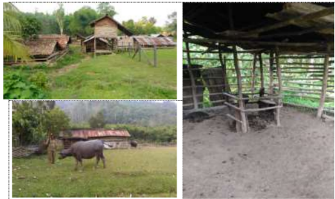
Fig-2: Cage building for buffaloes

According to Dirjen Peternakan [10], semi-intensive maintenance is maintenance of livestock which during the day are grazed in grazing land, then at night are strung. This semi-intensive maintenance is widely applied to buffalo farming farmers in Indonesia. Traditional maintenance of buffaloes generally tends to overlook good housing.