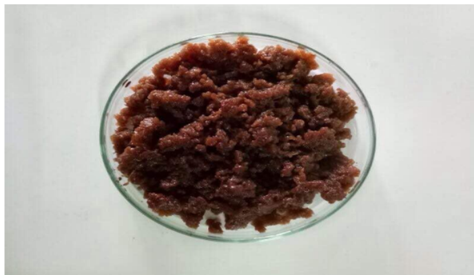
Figure 1. Pectin extracted from cocoa pod

Observations made on the pectin extracted from cocoa pod (Figure 1) are water content, ash content, yield, pectin level, methoxyl content and color.