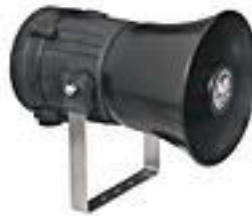
Fig 2. 855XH Hazardous Location Horns [7]