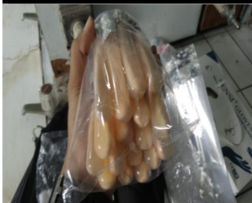
Figure 3 - Neurospora crassa