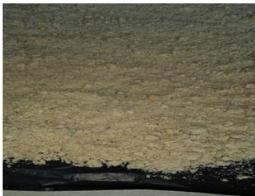
Figure 1 - Soybean meal waste (SMW)

The materials applied to conduct the study include SMW (Figure 1), A. ficuum (Figure 2), N. crassa (Figure 3), Potato Dextrose Agar (PDA), experimental chicken, distilled water, rice bran, standard mineral solution comprising of (\text{NH}_4)_2\text{SO}_4 0.14%, \text{KH}_2\text{PO}_4 0.2%, \text{MgSO}_4 \cdot 7\text{H}_2\text{O} 0.03%, urea 0.03%, \text{CaCl}_2 0.03%, \text{FeSO}_4 \cdot 7\text{H}_2\text{O} 0.0005%, \text{MnSO}_4 \cdot \text{H}_2\text{O} 0.00016%, \text{ZnSO}_4 \cdot 7\text{H}_2\text{O} 0.00014%, \text{CoCl}_2 0.0002%, pepton 0.075%, ADS solution, alcohol, acetone and \text{H}_2\text{SO}_4 72%. The equipment used is an autoclave to sterilize tools and materials for 1 kg size plastic bags (polypropylene), analytical scales, incubator cabinets, electric ovens, oasis needles, bunsen, test tube, cotton, aluminium foil, and trophy cups, a set of laboratory equipment for analysis.