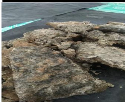
Figure 4 - Fermented SMW