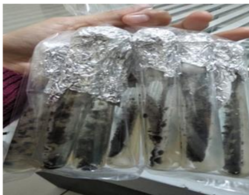
Figure 2 - Aspergillus ficuum