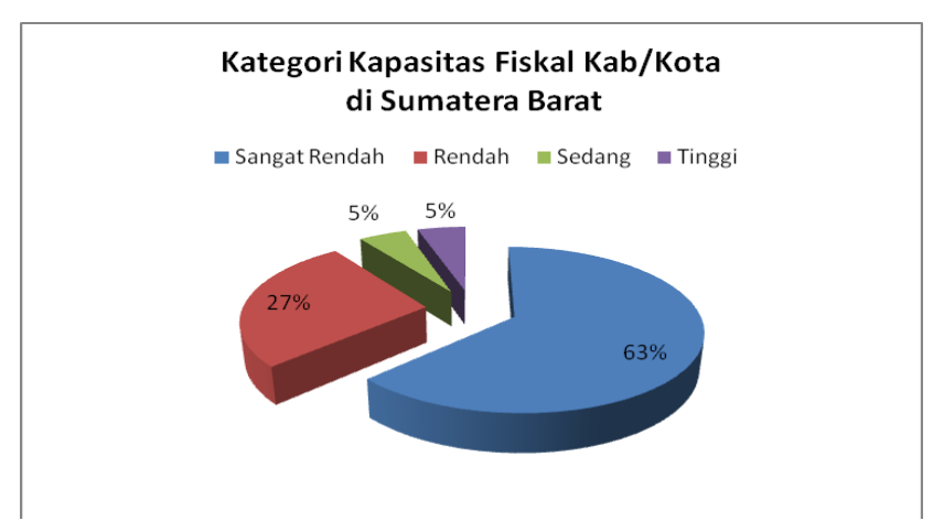
Fig 2. Regency / City Fiscal Capacity Category in West Sumatra 2018.

Some problems in the integration include the limitation of the budget and membership issues. Many lower-income families have not covered by NHI. Moreover, Some local governments that integrate into NHI also have low fiscal capacity (63.3%). Fiscal capacity in West Sumatra is described in figure 2. as follows: