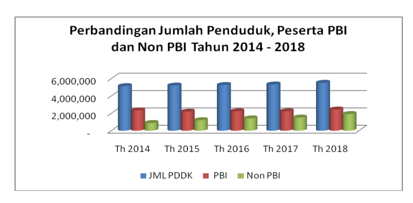
Fig 3. Comparison of Population, Number of national health insurance for poor people Participants and Non-PBI in West Sumatra Province Year 2014 – 2018

The control and supervision, as stated in the Governor Regulation of West Sumatra number 50 of 2014 Article 16 paragraph 1), 2) and 3), have not run according to their duties and responsibilities. The process must include Coordination Team, the Supervision Team, and the Monitoring Team. Each team is assigned by the Decree of the Governor of West Sumatra and the Head of the Provincial Health Office [10].