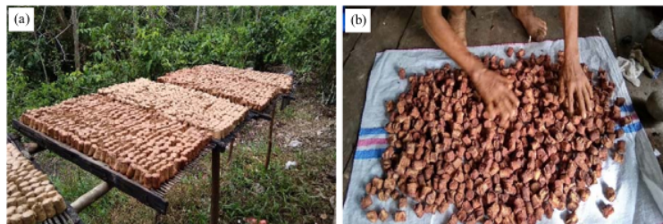
Fig. 8(a-b): (a) Sun drying of gambir and (b) Gambir