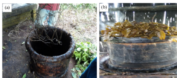
Fig. 2(a-b): (a) A bamboo container and (b) A bamboo container with Uncaria gambir leaves and branches