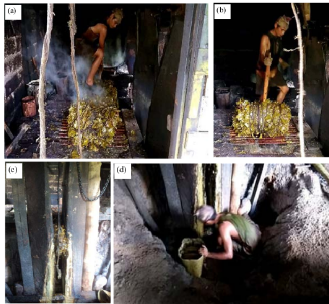
Fig. 4 (a-d): (a) A farmer arranging Uncaria gambir leaves and branches after steaming, (b) Cylinder form of Uncaria gambir leaves and branches ready for pressing, (c) Pressing process using mechanical extraction and (d) Collection of the extract