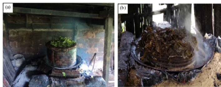
Fig. 3(a-b): (a) First steam and (b) Second steam