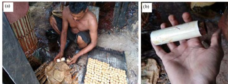
Fig. 7(a-b): (a) A farmer forms the gambir paste and (b) Die used to form gambir