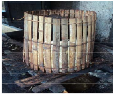
Fig. 6: Gambir paste surrounded by bamboo to reduce the water content