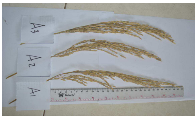
Fig. 2. Length of a panicle of 5 rice varieties inland flooding before planting treatment

Five rice varieties were examined in the assay showed that Panca Redek and Saganggam Panuah were the best varieties for the length of panicle than other varieties (Table 1). The length of panicle can be seen in Figure 2.