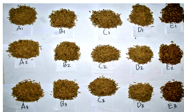
Fig. 3. Number of grains per panicle of 5 rice varieties inland flooding before planting treatment

The amount of grain was closely related to several pithy grains per panicle. The result also showed that the land flooding before planting did not affect the number of a pithy grain of rice (Table 3). Agroecology factors affected the rice grain, such as seed quality, cultivation technique, climate and weather, and pest and disease attack. The seed quality