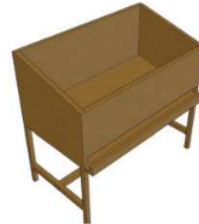
Fig. 4. Sugarcane Container

In the boiling workstations, there are some given recommendations and suggestions. The ideal operator's working posture is the neck and back in a straight line, and the legs are not bend based on the principle of work in a neutral posture and reduce excessive force. NBM questionnaire results show that the workers feel pain in all parts of their body except the upper neck. In addition to the use of the work equipment, the workers should use the work equipment in a comfortable state.