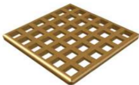
Fig. 6. Coconut Shell Place

The coconut shell is placed in molding workstation in order to help the workers in molding the saka. The place is made from wood named miranti. Fig. 6 presents the place to put the coconut shell. The place for the coconut shell has the length of 76 cm x 76 cm. This measurement considers the workers' hand in reaching something in the front side, which is 80cm, so it will have left out 4 cm more. The size of each coconut shell to be placed is 8 cm x 8 cm. This measurement considers the length of the coconut shell, which is 11 cm, so it leaves 1.5 cm of the right, and left the side of the coconut shell place. This condition makes the coconut shell stand and can be quickly taken by the workers.