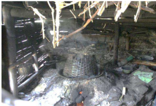
Fig. 2 Real condition of Boiling Work Station

The second part is the boiling workstation and the molding workstation. In the boiling process, the workers use traditional firework, which consists of two significant iron works and 100 pieces of coconut shell for molding. Fig. 2 shows the boiling workstation.