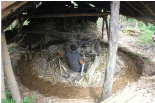
Fig. 1 Real condition of Milling Work Station

shown that these workers feel pain in all parts of their body except the neck and left hand.