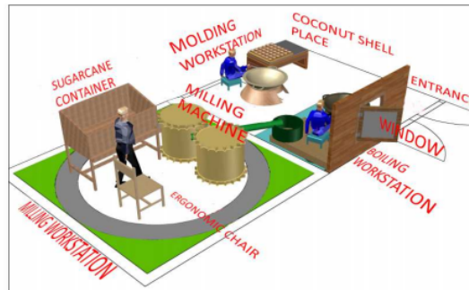
Fig. 8. Recommendation Design of the Workstation