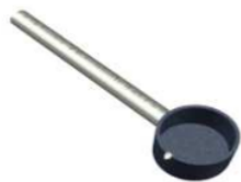
Fig. 7. Pouring Saka Spoon

The workers use the pouring saka spoon for pouring the saka into the coconut shell; then it is ready to be mold. The material of the spoon is polyethylene. It looks like a scoop that has a width of diameter 9 cm and has the depth of 5 cm. Fig. 7 shows the design of the pouring saka spoon. The last design is the workstation design layout for all of the workstations. The design shows in Fig. 8.