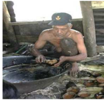
Fig. 3 The real condition of Molding Work Station

In the molding workstation, the process is being done on a pile of waste sugarcane that is not being used, and it is arranged as a mat. The work position of the workers is sitting cross-legged makes the pain appears from the back until the leg. Coconut shell is used in the molding process. The workers pour sugarcane sauce, which has turned thick into the coconut shell, which is laid on the mat. There is no any particular place to arrange the saka tidily. Fig. 3 shows the real condition of the molding workstation and the workers' position.