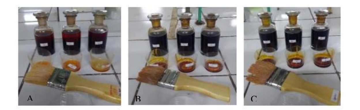
Figure 1.The appearance of produced varnish from ambalau resin extracted with methanol (A), ethanol (B) dan acetone (C).