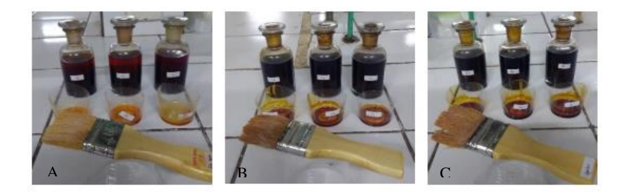
Figure 1. The appearance of produced varnish from ambalau resin extracted with methanol (A), ethanol (B) dan acetone (C).

drying time is about 7200 sec (Egbewatt et al, 2014). In this study, although the drying time met the quality requirement, however, the observed drying time was too fast. Therefore further development on the production of varnish from ambalau resin need to be considered. The utilization of retarder to prolong the drying time should be conducted further.