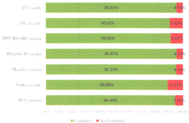
Graph 2. Vaccine Storing Temperature Condition at Territory Hospital in Padang City