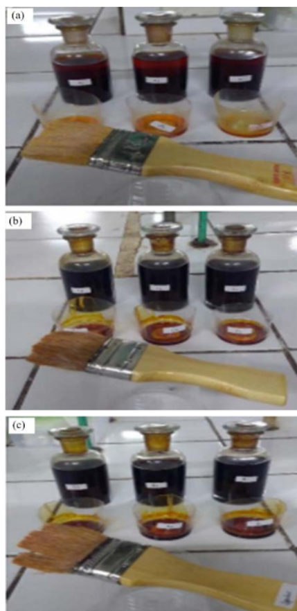
Fig. 1(a-c): Appearance of produced varnish from Ambalau resin extracted with (a) Methanol, (b) Ethanol and (c) Dan acetone

The desirable characteristics of varnish appearances in slightly viscous substances and yellowbrown colored varnish could be achieved. The appearance of produced varnish of three utilized solvent seemed similar to each other (Fig.1a-c). Table 3 shows the quality parameters of produced varnished from Ambalau resin. The observations were done for each extraction solvent (methanol, ethanol and acetone). Based on the results, it can be indicated that the varnish from Ambalau resin has met the standard parameter of wood varnish 15 . In addition of the viscosity, density and color parameters of varnish from Ambalau resin that met the quality standard of wood varnish, the main concern to indicate the quality of varnishes is shown by the volatile compound percentage and the drying time. The varnish from Ambalau resin that solved in polar solvents such as methanol and ethanol indicated the volatile compound percentage more that 65%. Although in acetone solution, the volatile compound percentage of produced varnish less than 65%, some further formula improvement could overcome this condition. Based on the