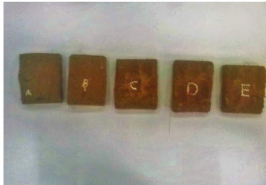
Fig. 2 Green state MOR test samples