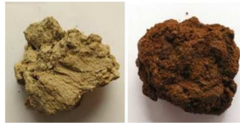
Fig. 4 Bentonite clays used as mould materials in this research, white bentonite (left) and red bentonite (right)