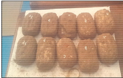
Fig. 1 Fabricated shell mould samples

(length x wide x thickness). The geometry of the pattern was intended to produce a plate shape mould as to perform 3 points flexural bending test to determine the samples strength. Total of 10 shell mould samples was fabricated whereas 5 of the samples required to determine the green strength, whilst the other 5 samples for fired strength. The fabricated samples are shown in Fig. 1. From these shell mould samples, MOR test samples were prepared by cutting the shell mould into a plate-shaped as Fig. 2 showing the green state of MOR test samples, and Fig. 3 showing fired state of MOR samples.