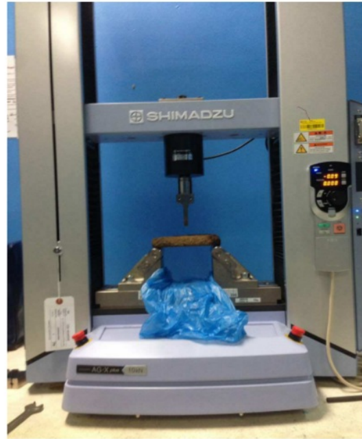
Fig. 5 Universal Testing Machine (Model: Shimadzu AGS-10kNXD) used to conduct 3 points flexural bending strength test in this research

where \sigma is the modulus of rupture (MPa), P is the maximum load applied until fracture occur (N), L is the length of span between two hold point (m), W is the width of the test samples (m), and H is the thickness of the test samples (m).