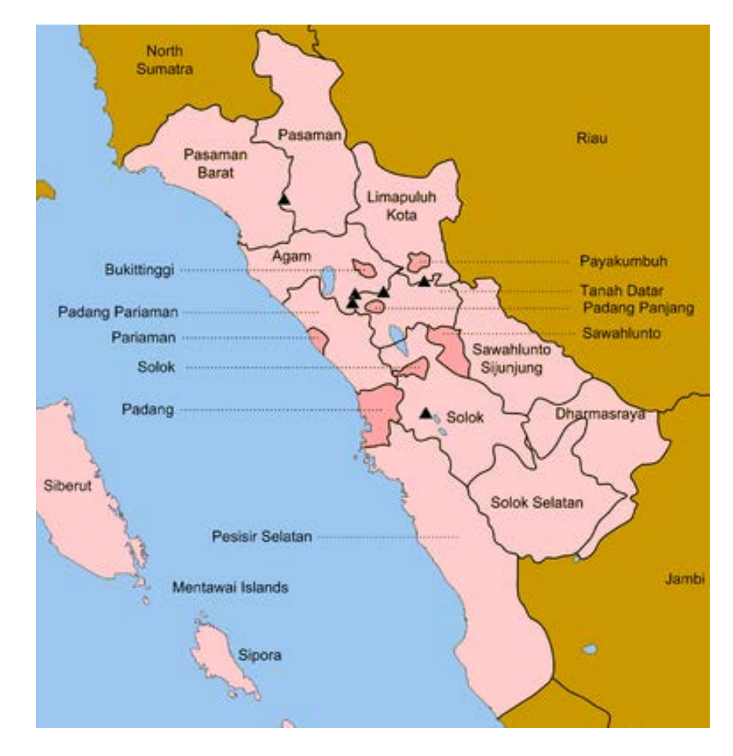
Fig. 1: Shellfish sampling sites in West Sumatra province, Indonesia

Sea shells are also abundantly available in coastal regions. The province of West Sumatra is directly adjacent to the Indian Ocean and has about 375 km of shoreline<sup>4</sup>. There are five districts (South Pesisir, Agam, Pariaman, Padang Pariaman, Pasaman) and two cities (Padang and Pariaman) located along coastal areas in Indonesia (Fig. 1). In these regions, green mussel (Perna viridis L.) and blood clam (Anadara antiquata L.) are popular shellfish species that are collected as marine commodities by traditional small-scale fisheries. Green mussels, popularly known as 'kerang hijau' are found in estuaries, whereas, oysters referred to as 'kerang darah' inhabit brackish and salt water<sup>5</sup>. Edible portions of shellfish are sold for consumption<sup>6</sup>, while 75-90% of shells from these shellfish are discarded<sup>7</sup>. The slow biodegradation of waste shells has raised concerns over disposal practices and environmental impact.