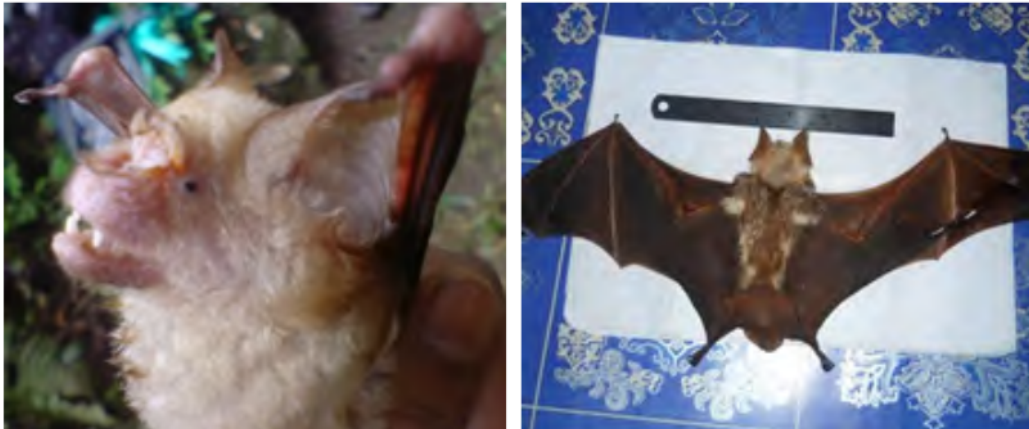
Figure 1. A diadem leaf-nosed bat, H. diadema , from Kalilawa cave, Padang, West Sumatra.