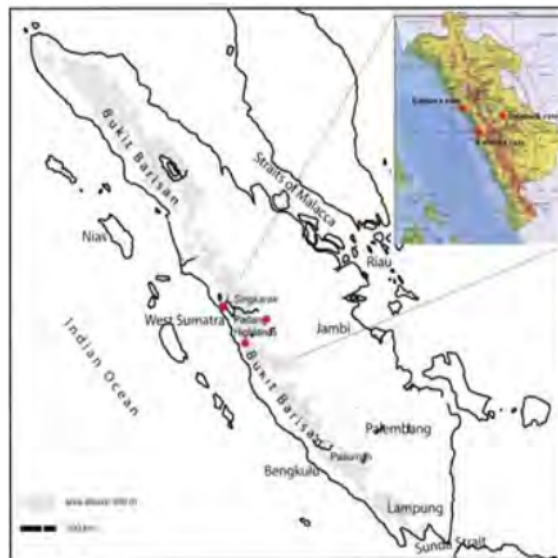
Figure 2. Locality of H. diadema specimens used in this study in West Sumatra (insert), Sumatra Island, Indonesia.

nose leaf width (LDA). The skull characters measured were the great skull length (GSL), cranial length (PIL), least interorbital width (LI), zygomatic width (LTP), width across caninus to another caninus from outer basal face (CCB), palatal bridge length (PBL), width across molar to another molar from outer mass face (MMB), tympanic bulla length (TBL), tympanic bulla width (TBB), cochlea width (CW), cranial height (CH), rostrum height (RH), rostrum length (RL), lower tooth row length (IML) and dentary length (DL) (Figure 3).