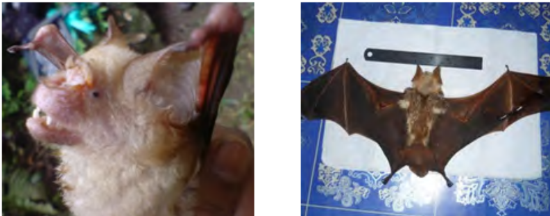
Figure 1. H. diadema collected from Kalilawa Cave, Padang, West Sumatra.