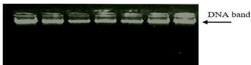
Figure 1. Electrophoregram of genomic DNA of the research subject.

The success and effectiveness of DNA isolation results are controlled using electrophoresis techniques. Electrophoresis was run on an agarose gel 1.5% with a voltage of 100 volts for 30 minutes. The results of DNA extraction and electrophoresis for seven samples as seen as Figure 1.