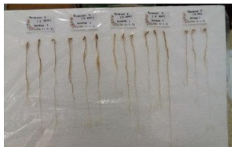
Figure 1. the poisoned roots by Al. (1) the shorter root that poisoned by Al than un-poisoned root by Al

The division of cells will be inhibited in the poisonous plants especially in root cells. It was caused by Al binding with DNA and ending the cells division process of apical meristem (Awasthi et al., 2017). Root cap, meristem, and root elongation zone are the most susceptible to Al. In these parts, the accumulation of Al is more than others. The toxicity of Al caused the P level in root decreased and it caused the root will be shorter (Aluwihareet al., 2016). The poisoned root can be seen in Figure 2.