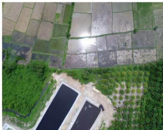
Fig. 1 Paddy soil contaminated by palm oil mill wastewater in Mangopoh Village, Agam District

The research was conducted in the soil field in Mangopoh Village, Agam District, West Sumatra, Indonesia at June-August 2018 as in Figure 1. Materials and equipment used include mineral soil drill (auger Belgium), Munsell book, GPS, sampling ring, and plastic samples. Figure 1 below shows the paddy soil which is contaminated by palm oil wastewater.