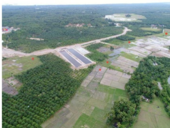
Fig.2 Location of rice field sampling contaminated by palm oil mill wastewater

The first sample was from the undamaged field upstream, while the second was from the contaminated rice field area, through land leveling from the closest point to the spill source, down to the furthest, in the direction of irrigation flow. The analysis of physical properties was performed on the uncontaminated unit, while chemical and biological evaluation was conducted on the supposed polluted filed.