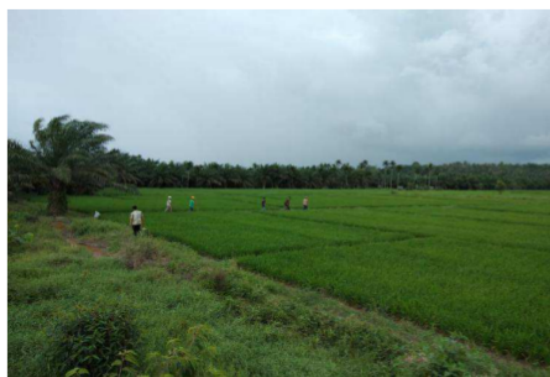
Fig. 5 Rice growth affected by wastewater spill palm in Manggopoh Village after 2 months.

The results of the analysis did not indicate any significant differences and influence on the control and the contaminated locations were due to land saturation and water circulation. This was as a result of irrigation and rain. Figure 3 shows the highest value was recorded at location 1 (control), while the lowest mean was at location 3, which was within the 200 m range of the waste pond. The graph of means grouping using Fisher's test shows palm wastewater did not significantly affect soil properties. Figure 4. show group of average value from Fisher's test; the value of the nature of the high ground is more likely to be in the positive zone. Meaning the change in soil properties is not too full due to palm waste. Besides, several studies have reported its capacity to be used as organic fertilizer, and Figure 5 shows the effect on the growth of rice for 2 months.