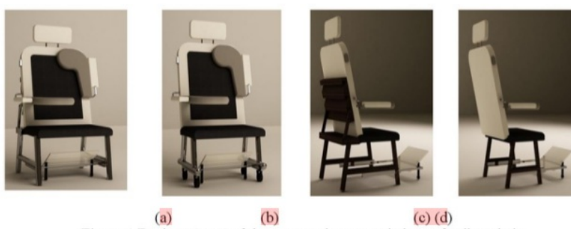
Figure 1 Designs 1 to 4 of the proposed ergonomic breastfeeding chair.

Design 4 has similar material to Design 3, but had a removable headrest. Design 4 is shown in Figure 1(d).