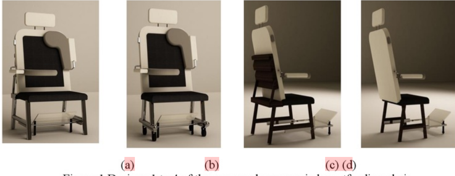
Figure 1 Designs 1 to 4 of the proposed ergonomic breastfeeding chair.

Design 4 has similar material to Design 3, but had a removable headrest. Design 4 is shown in Figure 1(d).