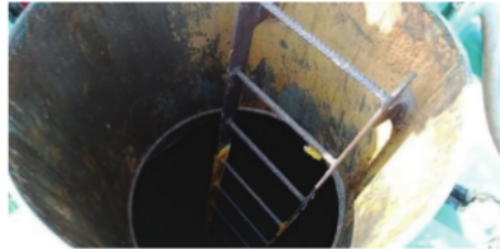
Figure 1. Confined space

Based on observations made, it was found that work accidents occur as much as 1 to 2 times in limited space each month. This data includes all incidents that have resulted in serious injury or illness. Based on this, hazard identification and risk assessment and control are needed to prevent and reduce the potential for workplace accidents in limited space work at PT Bandar Abadi Ship Builders And Dry-Docks.