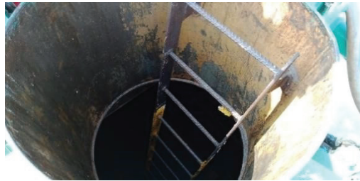
Figure 1. Confined space

Based on observations made, it was found that work accidents occur as much as 1 to 2 times in limited space each month. This data includes all incidents that have resulted in serious injury or illness. Based on this, hazard identification and risk assessment and control are needed to prevent and reduce the potential for workplace accidents in limited space work at PT Bandar Abadi Ship Builders And Dry-Docks.