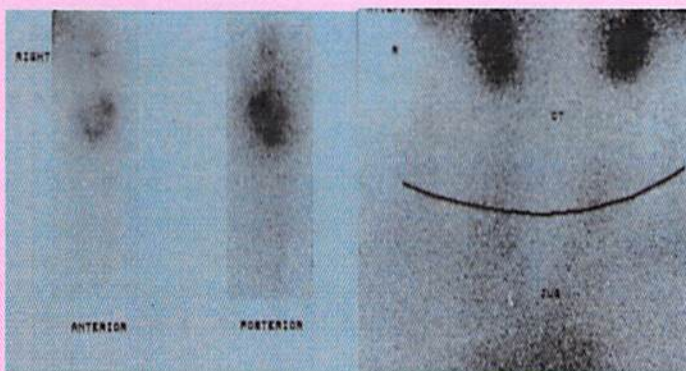
Figure 1 : Scintigraphy result after received 29,5 mCi of NaI-131.(A) Whole body image. (B) thyroid bed image. Images only show lacrimal glands and gastro-intestine tract avid radioiodine. We cannot detect avid of radioiodine the rest of the body.

After four weeks of thyroxin withdrawal, TSH, thyroglobulin, and anti-thyroglobulin results are 2.77 mU/L, 1.78 ng/mL, and negative, respectively. Level of TSH does not increase after thyroxin withdrawal. Thyroid scintigraphy using 99mTc showed no uptake in thyroid bed. Furthermore, she received 29.5 mCi of I-131. Image from iodine-131 whole body scan does not show uptake of I-131 at thyroid bed and skull area. 99m Tc-methylene disphophonate (MDP) bone scintigraphy demonstrated high uptake at right and left parietal bones and cold lesion at frontal bone. Hot spot also notice at 1/3 distal of right femur bone.