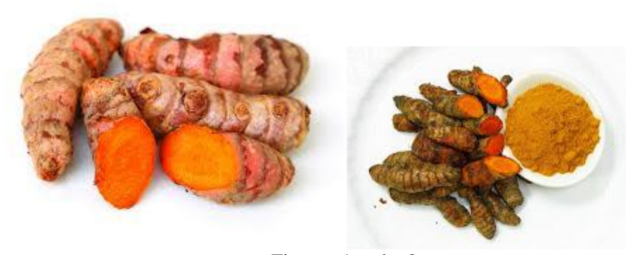
Figure: 1 and 2

Turmeric or turmeric (Curcuma longa / Curcuma domestica) is one of the spices and medicinal plants native to Southeast Asia. Turmeric classified in the group of gingers, Zingiberaceae. The main content of turmeric is curcumin and essential oil that serves to analgesics in dysmenoroe, Menstruation is not smooth, stomach heartburn during menstruation, (Rahman, 2000).