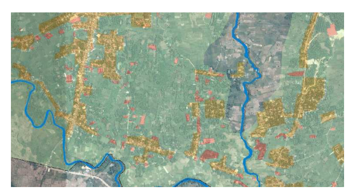
Fig 1. Delineation of settlement area (red zone) was changed from agricultural land within five years in Limapuluh Kota Regency.

Table 2 shows the total number of settlements in the allocation of agricultural land. This finding tells about the change of agricultural land into housing or land that is not utilized, which might have an impact on the amount of agricultural production, and certainly will have a negative impact on the success of sustainable agriculture development programs [15].