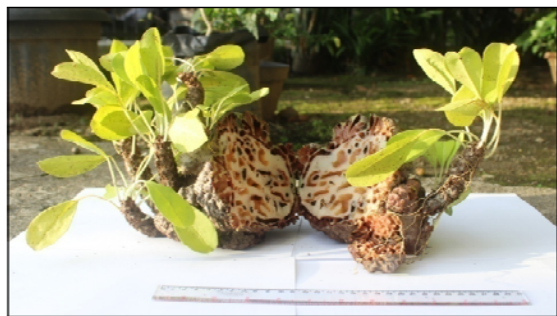
Fig. 1: A fresh "ant nest" tuber Myrmecodia tuberosa Jack

Mark) spectrophotometer, erythrocyte pipette, hemocytometer and microscope (ZEISS).