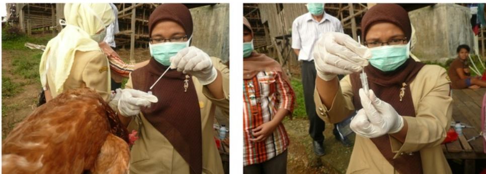
Figure: 3. Rapid test to chicken

In the fact of the year 2009 increased again one district that previously had not affected the District Bungus Teluk Kabung. With chicken deaths recorded by the Department of agriculture, livestock farming and forestry 33 chickens Padang included into the areas of contracting bird flu or Avian influenza (endemic) to 10 districts in the city of Padang. However in 2010 is still a chicken, didn't reported positive cases of bird flu in other animals including humans. So as an organization the Office area of agriculture, animal husbandry and forestry plantations Padang trying to do the handling and control of bird flu that is not contagious to humans.