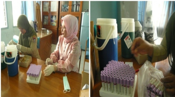
Figure 2. Separation of serrum from blood sample of chickens