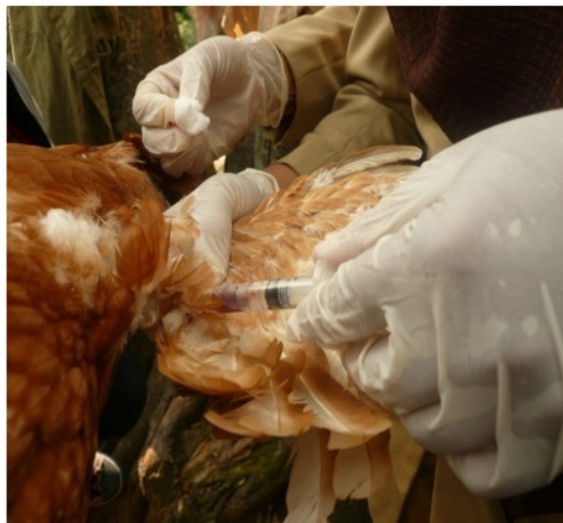
Figure 1. Blood sampling can be done through the wing vein blood samples brachialis