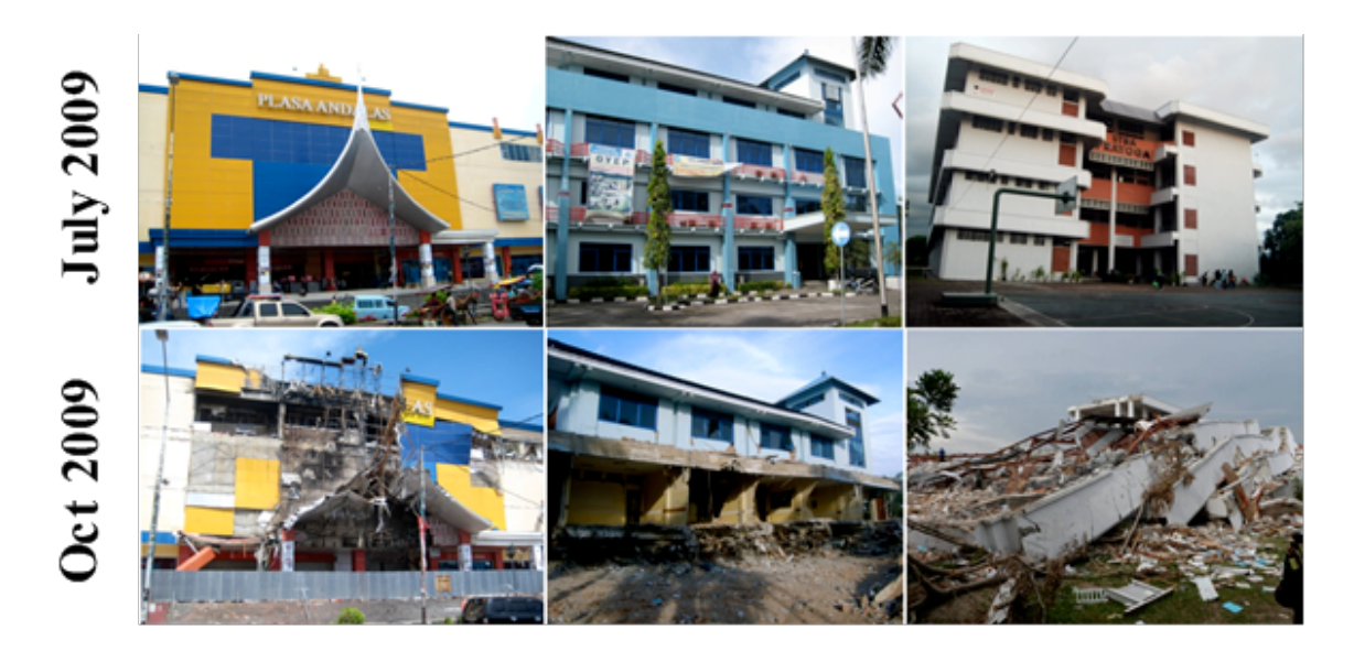
Figure 4. Before and after photos of buildings that had been recommended as evacuation sites. From left to right: Four story mall, partial collapse on the 4<sup>th</sup> floor and fire; 4-story language school, collapse of first 2 stories; 4-story junior college, complete collapse. Image source: EERI.

Buildings that had been previously recommended as potential tsunami evacuation sites varied in performance. Many suffered heavy structural and nonstructural damage, while a few completely collapsed. This wide spectrum of performance demonstrates the need for a more thorough analysis of buildings, before any are recommended as evacuation sites. Although some of the building's structural system remained intact, nonstructural damage was so intense that most people would have felt unsafe going inside. Therefore, their use as evacuation sites remained ineffective. Of the 31 potential evacuation buildings visited by the EERI reconnaissance team, 1/3 were found to have collapsed or were heavily damaged, and roughly <sup>3</sup>/<sub>4</sub> of the buildings had sufficient damage still to be closed two weeks after the earthquake. Figure 4 shows before and after photos of some of these buildings.