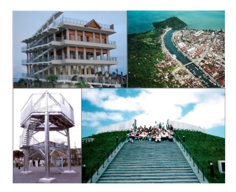
Figure 2. Examples of tsunami evacuation structures. (Top left) Tsunami evacuation building in Banda Aceh, built after the 2004 tsunami. This building's secondary purpose is to serve as a community center. (Bottom Left) Pre-fabricated structure in Japan with the sole purpose of serving as an evacuation site during a tsunami. (Top right) Aerial photo of a bridge in Padang that provides access to high ground from the city center. (Bottom Right) A soil berm in Japan that provides refuge during tsunamis.