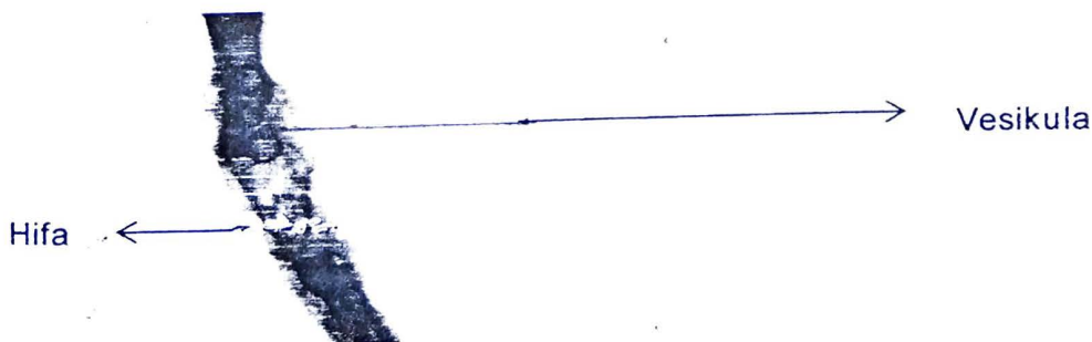
Figure-2: Infection of AMF on plant rhizosphere with vesicle and internal hyphae

Infection of AMF on rhizosphere of plant was shown in figure 2.