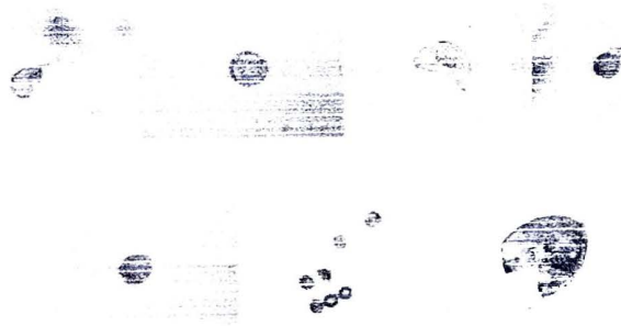
Figure-1: Spores of AMF found in coal mining used land in SawahLunto [a] G. Claroideum SC 186A. spinoso WV 861 AA. scrobiculata BR984A. tuberculata VZ 103 E and [b] G. etunicatum NE 108A Glomus Luteum SA 112 Gl. Sp

Infection of AMF on rhizosphere of plant was shown in figure 2.