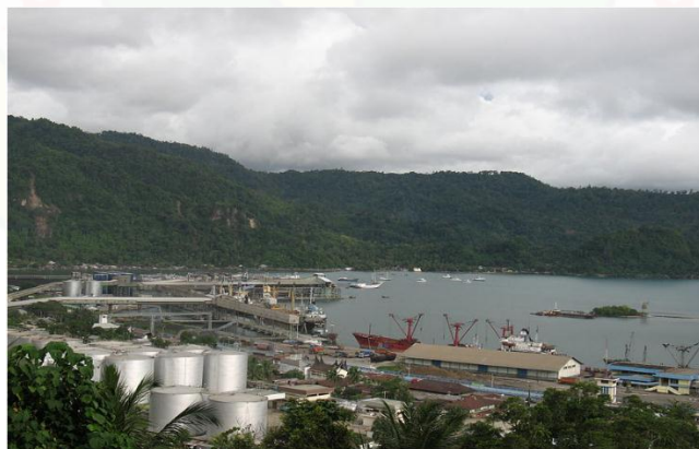
Figure 1. Teluk Bayur Seaport

The loading and unloading workers in Teluk Bayur Seaport are a kind of worker relying on human labor as the main thing. This type of work in ergonomics is known as manual material handling. Types of work include lifting, carrying, pushing, and pulling tasks. According to the Regulation of the Minister of Transportation of the Republic of Indonesia number 60 of 2014, the loading and unloading activities at Teluk Bayur Seaport consist of stevedoring, cargo doring (for the goods loading from dock to warehouse and vice versa), and delivery (the job of taking goods from the warehouse to the top of the vehicle and vice versa).