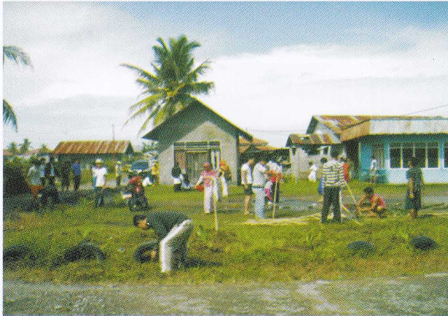
Figure 8. Application of cooperation with citizen and college student