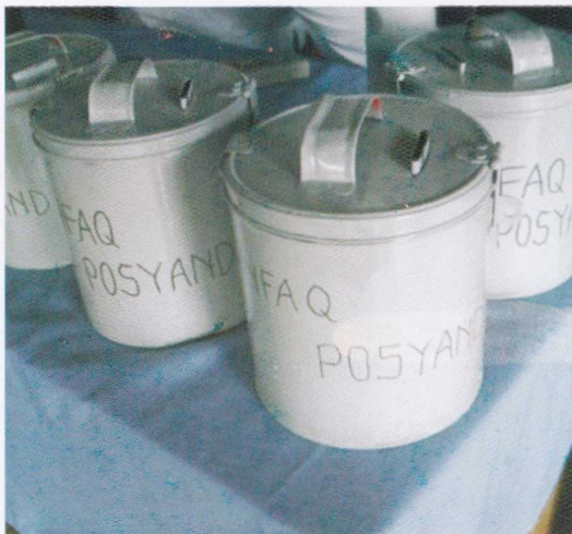
Figure 14. Making Active "the distributing thousand for health" each house hold