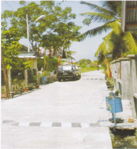
Figure 18. This environment after being renovated