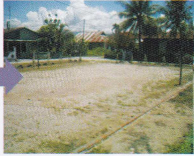
Figure 17. Condition Before and After Intervention