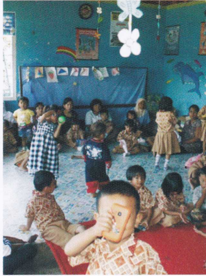
Figure 22. The Children Aged 2-5 Years Are In School 3 Times In A Week