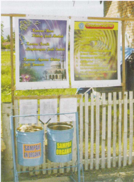
Figure 19. They separate between organic and un-organic rubbish