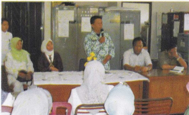
Figure 4. The chief of Jati village announced to form a working group

After being found the primary problem, the chief of Jati village, with the citizen and society figures, committed to create a group which manage as well as coordinate the interfering activities of the primary problem, existing at Jati village.