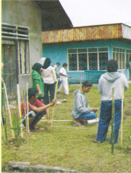
Figure 9. Making the bamboo fence of the family herbal plants