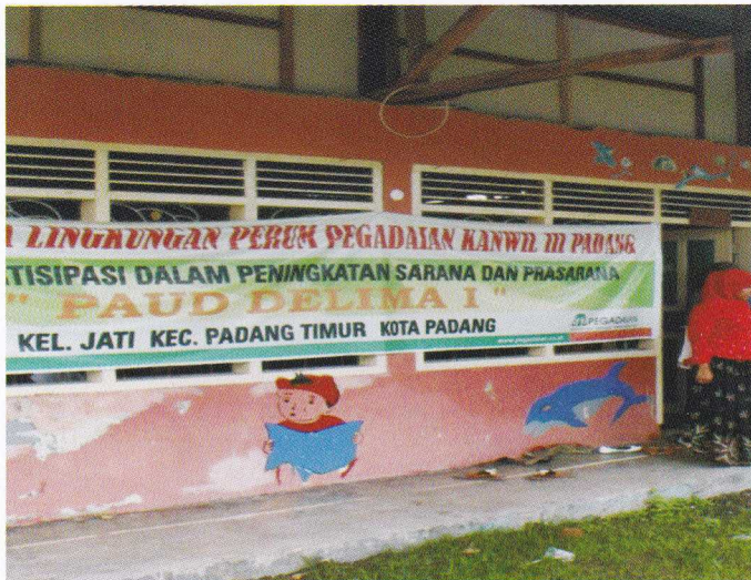
Figure 21. Earlier Child Education and Development