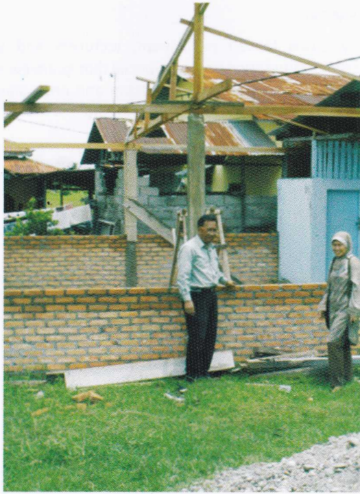
Figure 24. Building Based On Community Funding