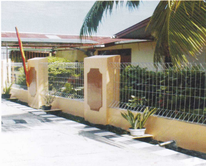
Figure 20. The environment is clean, no garbage in ditch