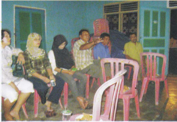
Figure 3. The citizen are curious to discuss about finding out the solution of their problems