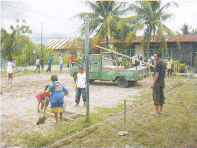
Figure 11. Guiding the young generation through restoring the sport youth centre “volley court”