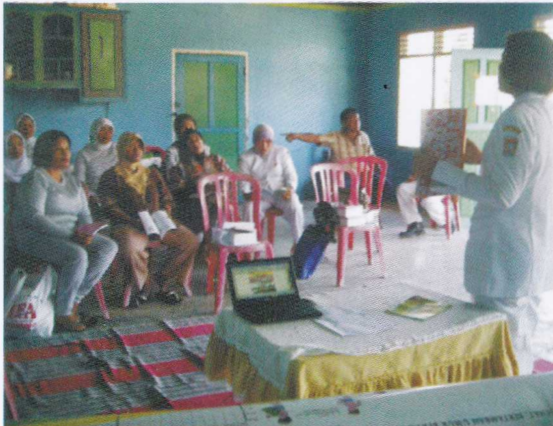
Figure 13. Refreshing the cadre of integrated public health services

Counseling of entrepreneurship, counseling the behavior of clean & healthy life style, counseling as well as recycling about all garbage, refreshing cadre of integrated public health services