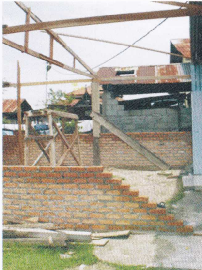
Figure 23. Additional Room For The Actify For Senior Citizen 2011