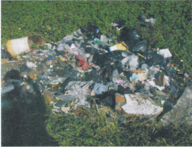
Figure 1. Attitude of the community throw away all garbage in environment

The main problem of the behavior of healthy and clean life style show that is there were still many smokers around the house (46,2%) as well as there were so many people not doing exercise regularly everyday (86,6%) and there were so many people not consuming vegetables and fruit everyday (36,1%). There are the pregnant women who have high risk bearing (25,9%) and under nutrition for the children under five years old was 8,5%.