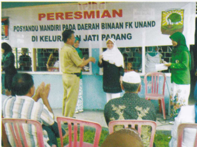
Figure 16. Official ceremony of the new revitalization of integrated public health