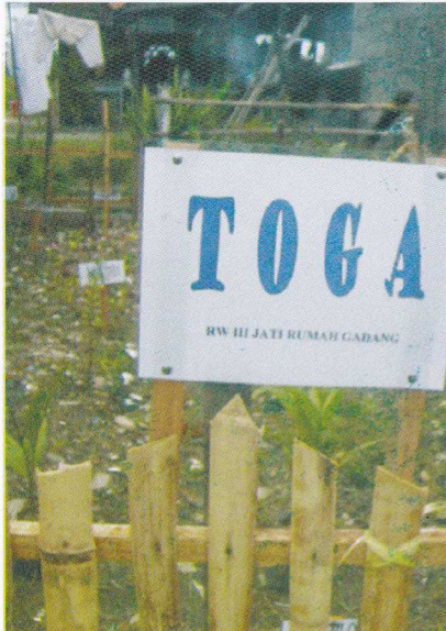
Figure 10. Growing the family-herbal plants

Toga stands for family herbal plants. This is the examples of herbal plants which they plant in their house yard.