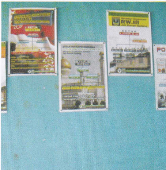
Figure 12. Setting & sticking the structure of organization