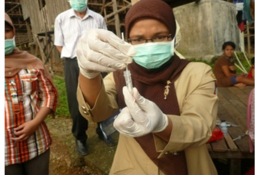
Figure: 3. Rapid test to chicken