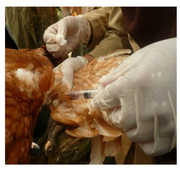
Figure 1. Blood sampling can be done through the wing vein blood samples brachialis

Prepare the necessary equipment (sterile syringe, cotton alcoholic, labels and sterile vials). Syringe 3 ml. Routes depending on size of chicken blood sampling, the DOC through the heart (intracardial) whereas large chicken wings can be via the brachial vein